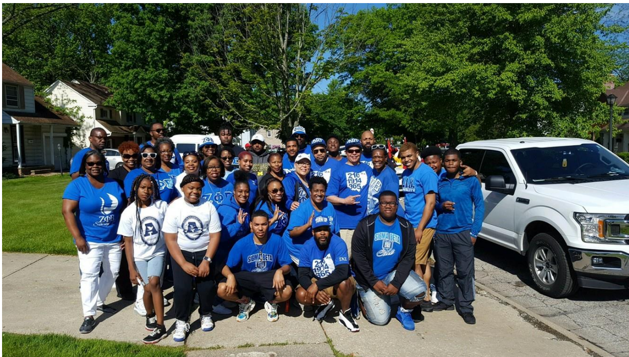
Sigma's, Zeta's, Amicae, Sigma Beta's and, Archonettes participating in the 2019 Warrensville Heights Memorial Day Parade.