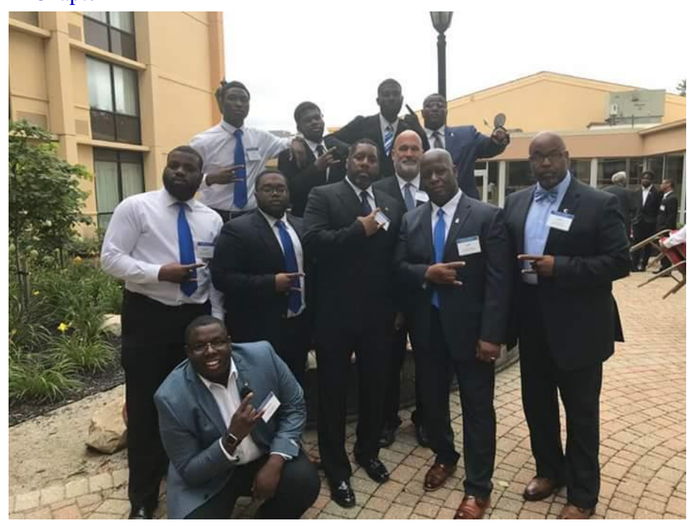
Collegiate and Alumni of the Epsilon Epsilon "Mau Mau" Chapter