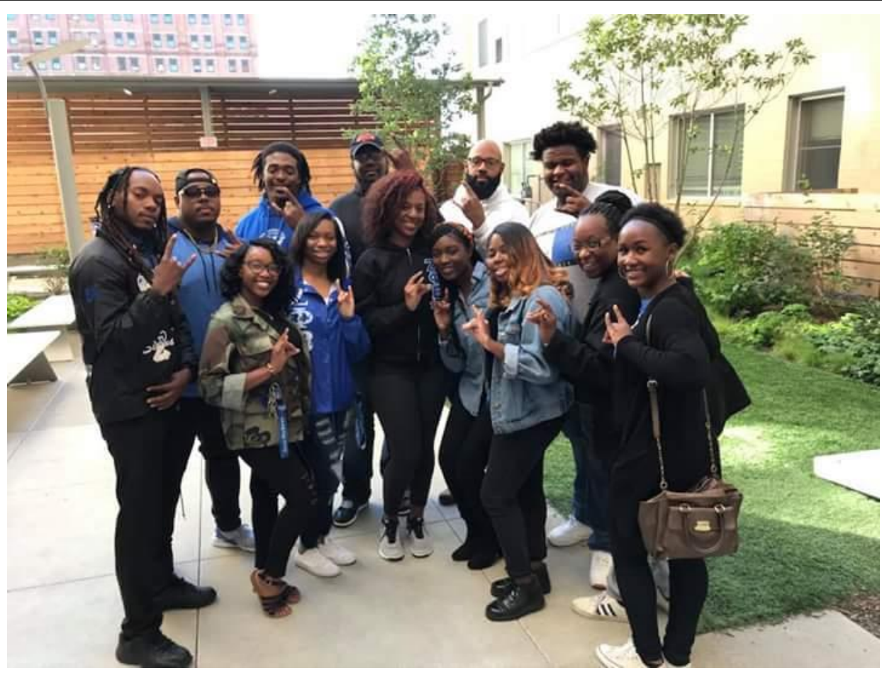
Members of the Blue & White family hanging out during the cookout at The Edge apartment complex in the courtyard in Downtown Cleveland across from Cleveland State University on Saturday