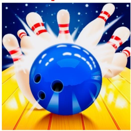
Saturday, November 3, 2018 3-6pm Rollhouse - Wickliffe 28801 Euclid Ave., 44092