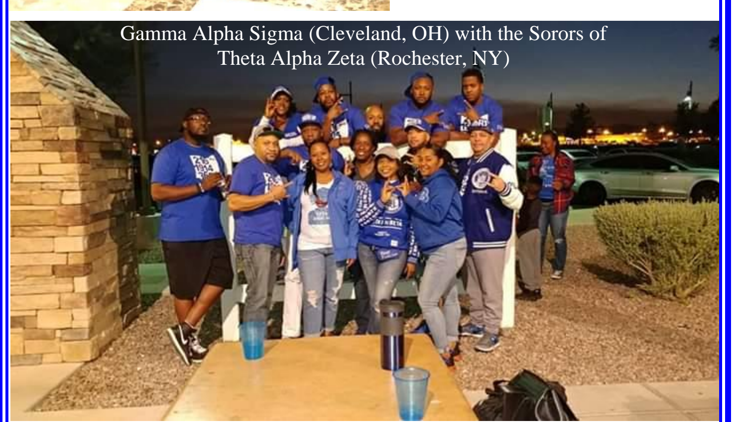
Don't be the brother who misses out on next year's trip because....