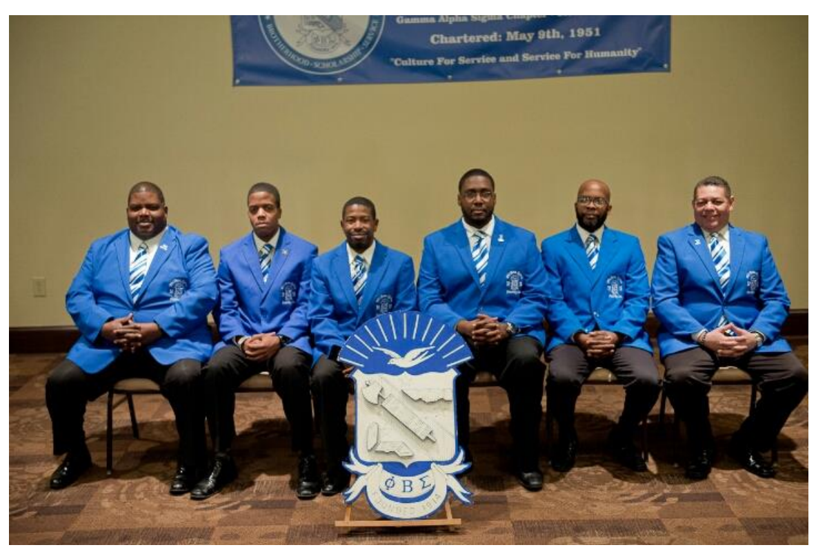
Phi Beta Sigma Fraternity, Inc. Gamma Alpha Sigma Chapter Cleveland, Ohio