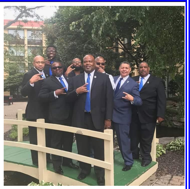
Collegiate and Alumni of the "Elite" Epsilon Phi Chapter