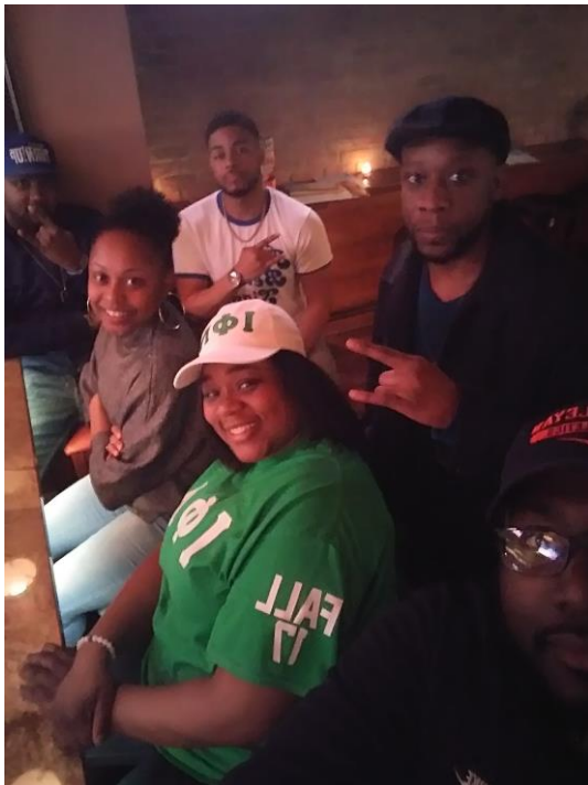
Members of Phi Beta Sigma, Delta Sigma Theta and Iota Phi Lambda kicking it at FIRST FRIDAY at Bourbon Street Barrel Room in March

The chapters FIRST FRIDAY Happy Hours continue to be a good setting for brothers, friends, fellow Greeks and all to come out, relax, meet people / other brothers they may not know and, show ourselves as a collective group and force around the city of Cleveland. If you haven't been to one, I suggest you come on out! Here are a couple pics from our FIRST FRIDAYS from January, February and March: