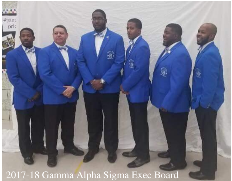
2017-18 Gamma Alpha Sigma Exec Board