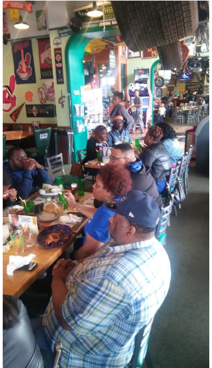
Sigma's, Zeta's, Sigma Beta's, family and friends at Quaker State supporting our Dine to Donate efforts for March for Babies / March of Dimes