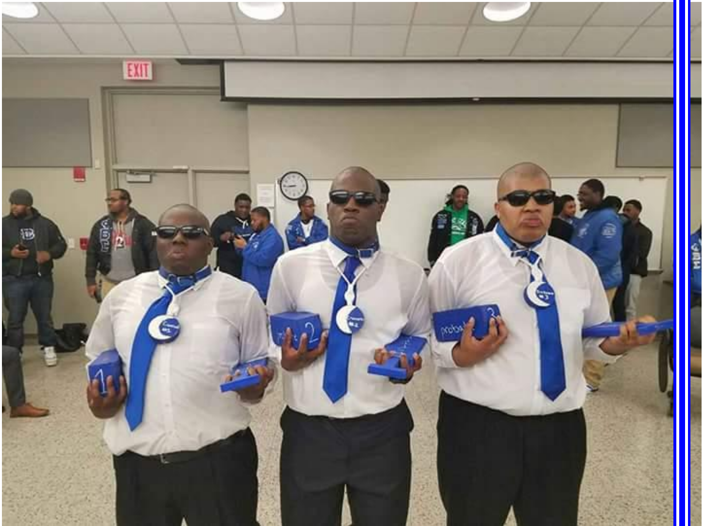
The newest members of the Epsilon Epsilon (Mau Mau) chapter at Kent State University getting ready to show out at their Probate