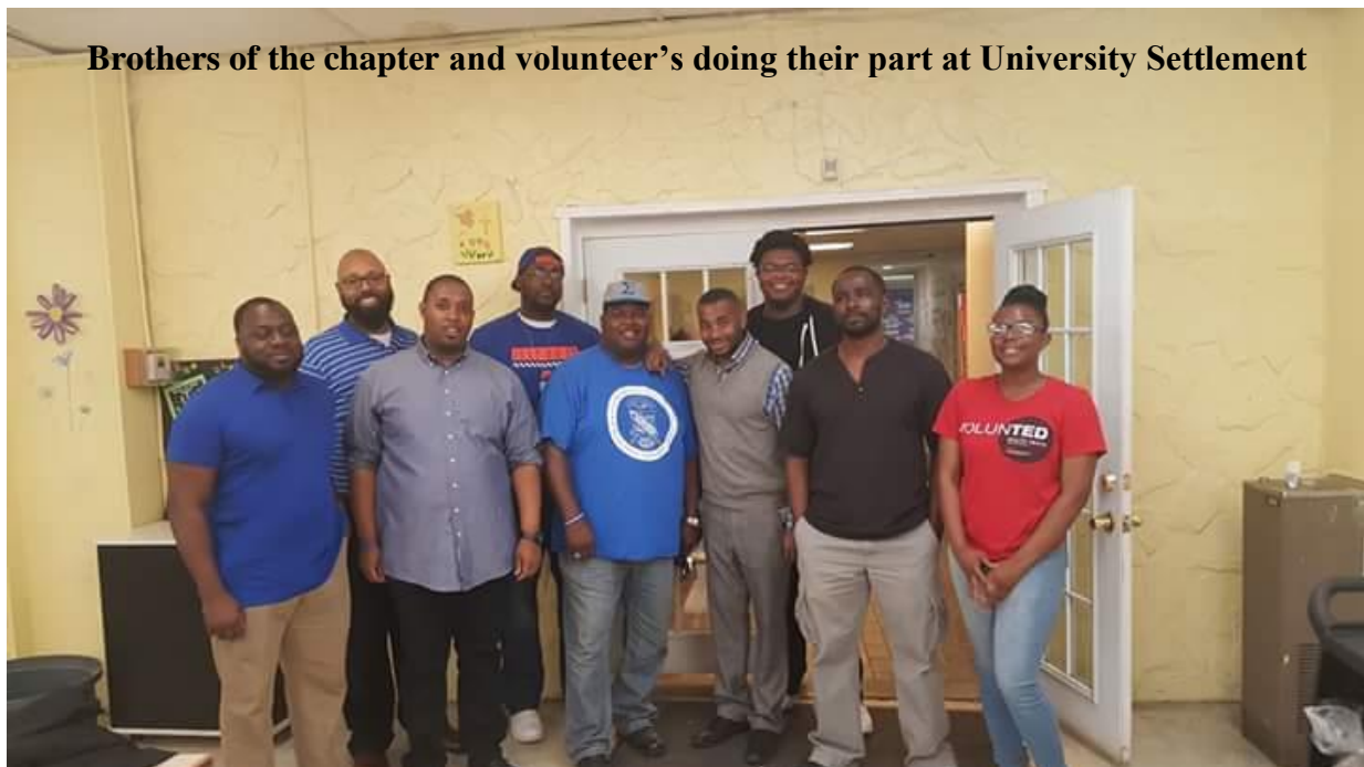
Brothers of the chapter and volunteer's doing their part at University Settlement

We want to thank the brothers and volunteers who came out on Tuesday May 23 rd , 2017 to University Settlement as we get ready to go full throttle with our efforts there again. The chapter had to take a light hiatus from University Settlement as other groups had booked into the time we are usually there but with the coming of summer and schedules of other groups/individuals getting tied up, Gamma Alpha Sigma will be back to going on our usual 4 th Tuesday of every month. For the brothers who do not know what University Settlement is or what they do, University Settlement is a neighborhood center that provides social services to residents of the Broadway-Slavic Village neighborhood in southeast Cleveland.