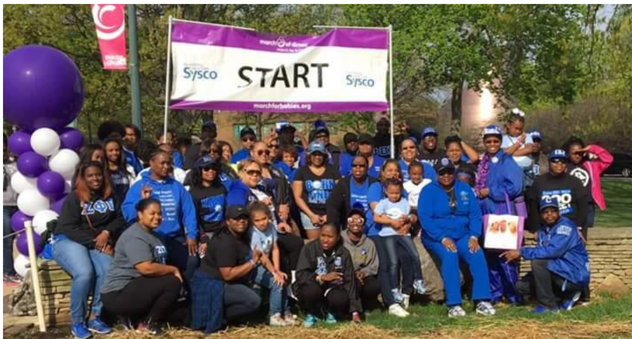
Blue and White at March for Babies / March of Dimes 2017

*Battle of the Blue Juice Cabaret Highlights* *2017 NFL Draft Night / Sigma Round Up*