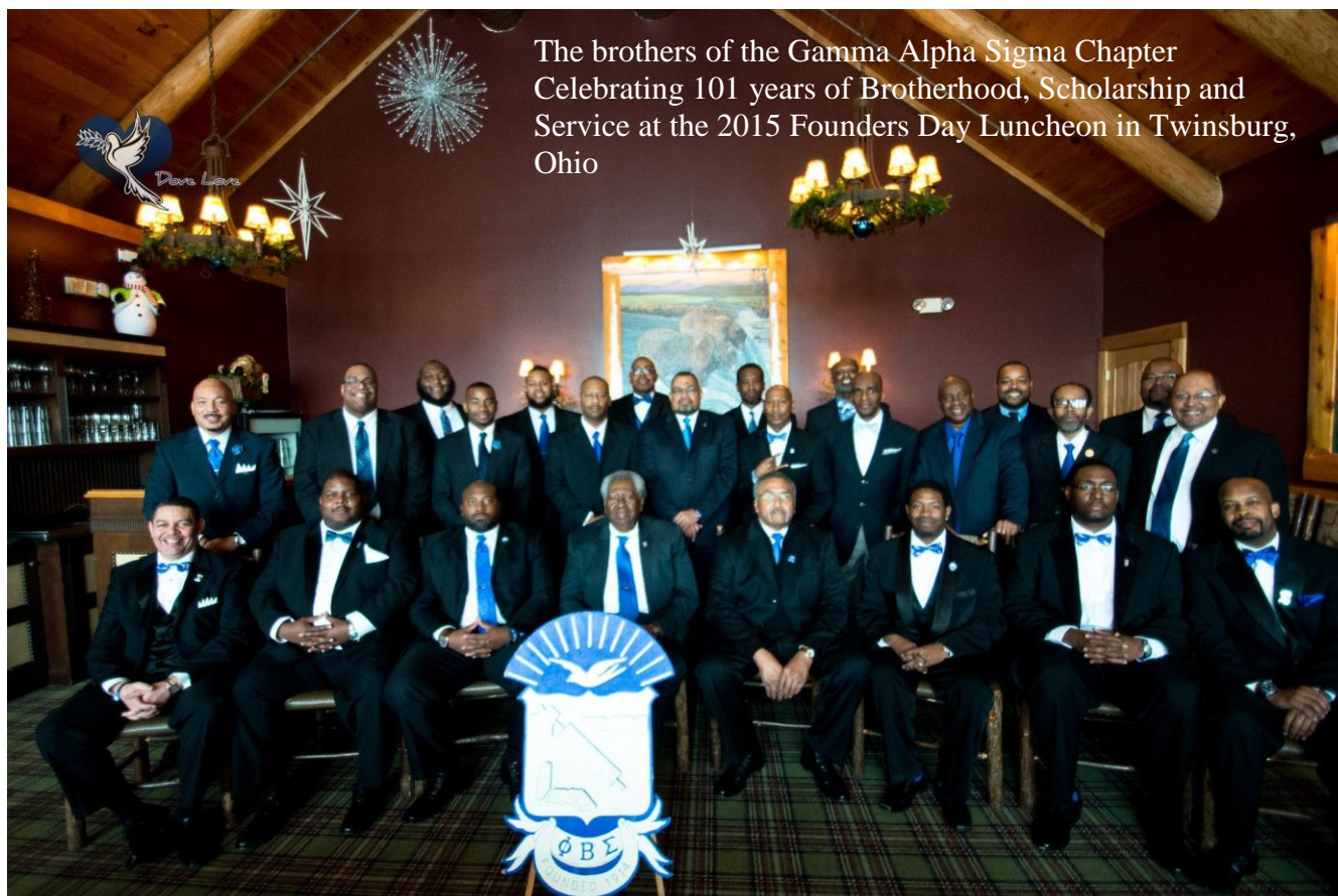
The brothers of the Gamma Alpha Sigma Chapter Celebrating 101 years of Brotherhood, Scholarship and Service at the 2015 Founders Day Luncheon in Twinsburg, Ohio