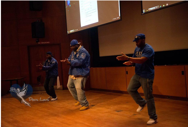
Gamma Alpha Sigma brothers.....