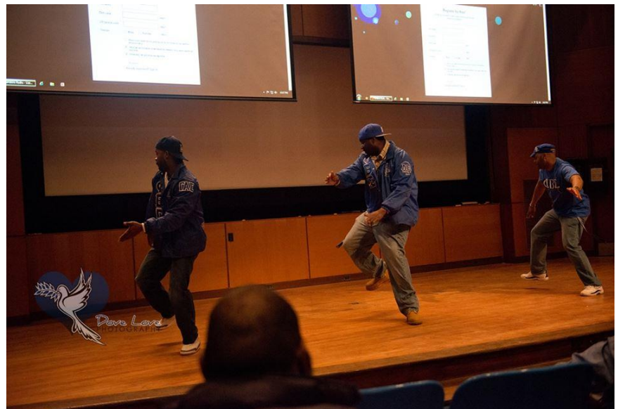
.....Stepping at Case Western Reserve University