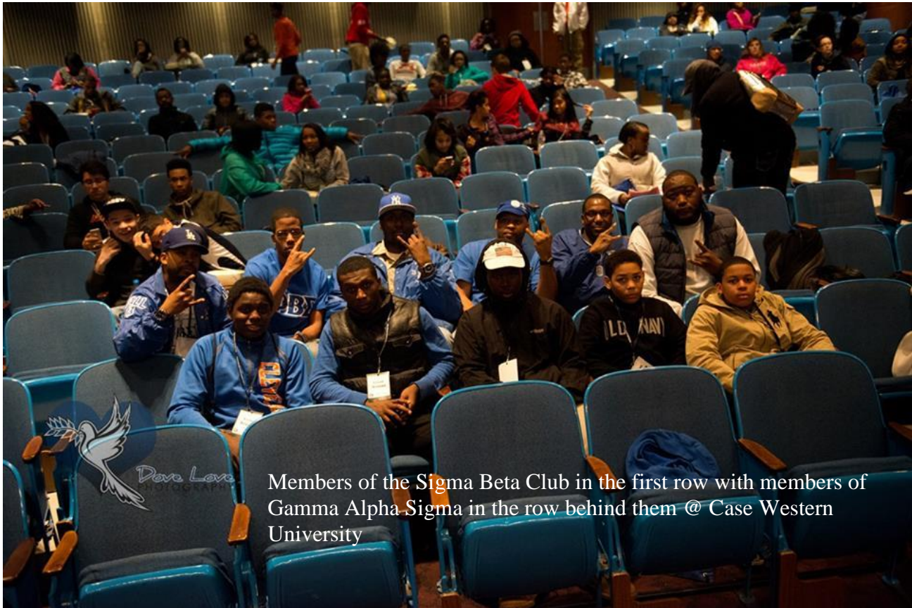
Members of the Sigma Beta Club in the first row with members of Gamma Alpha Sigma in the row behind them @ Case Western University