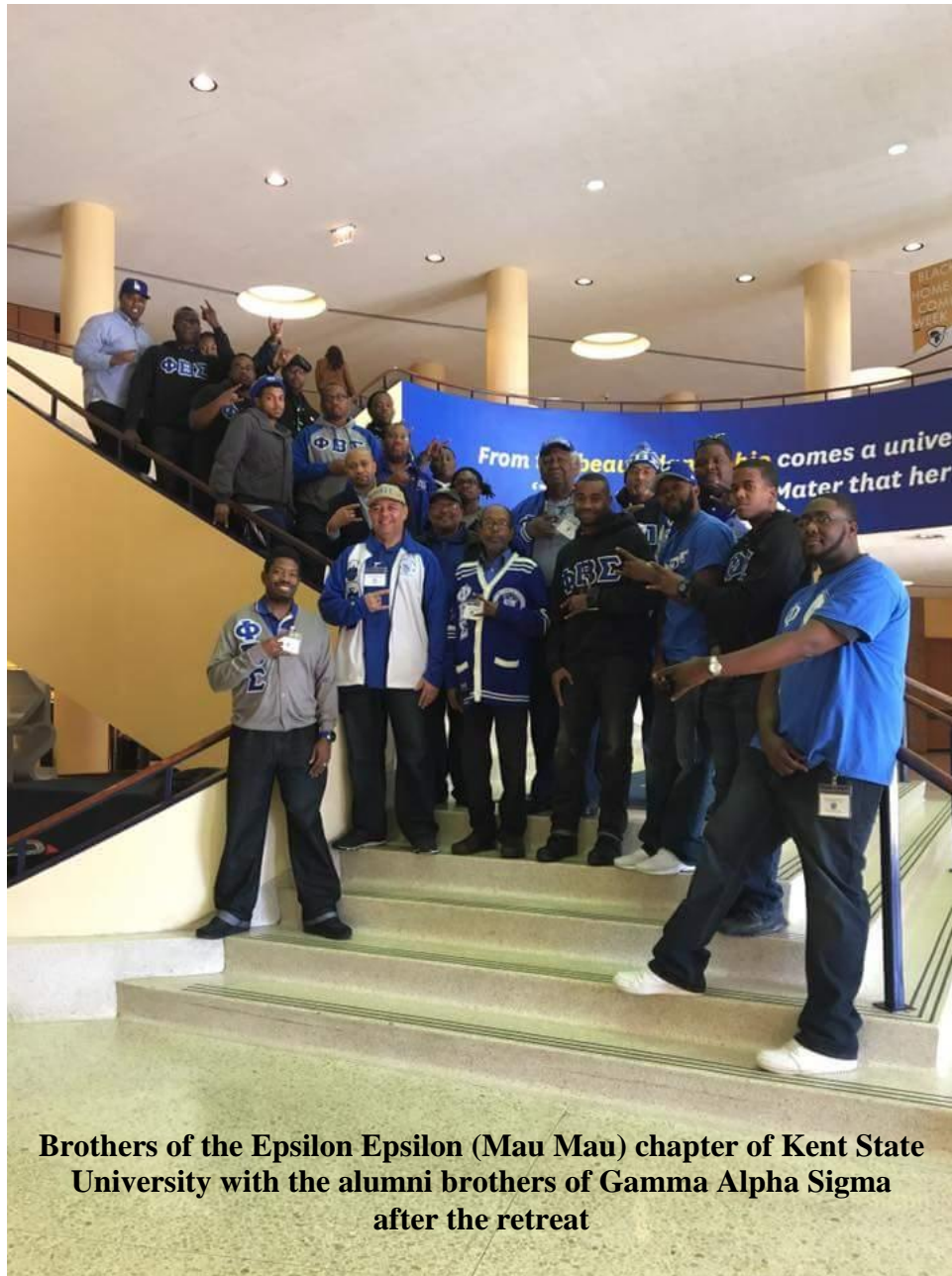
Brothers of the Epsilon Epsilon (Mau Mau) chapter of Kent State University with the alumni brothers of Gamma Alpha Sigma after the retreat

We want to thank the brothers of the grad chapter who were able to come out and participate in the inaugural chapter retreat which took place on Saturday November 5 th in the Student Center @ Kent State University. Special shout out to the brothers of the Epsilon Epsilon chapter who not only secured the space for us on their campus but were highly active in the day's event as well. The current exec board of the chapter felt that this retreat was needed and long overdue to address some growing concerns amongst the membership and board. By the end of the day, many items were laid out on the floor, addressed and action items put in place to move forward as we gear up for 2017.