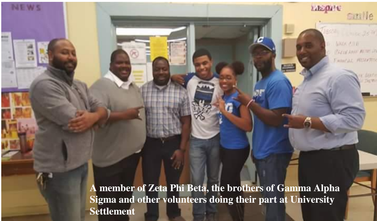
A member of Zeta Phi Beta, the brothers of Gamma Alpha Sigma and other volunteers doing their part at University Settlement