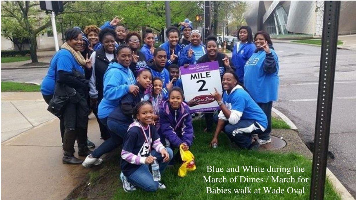
Blue and White during the March of Dimes / March for Babies walk at Wade Oval