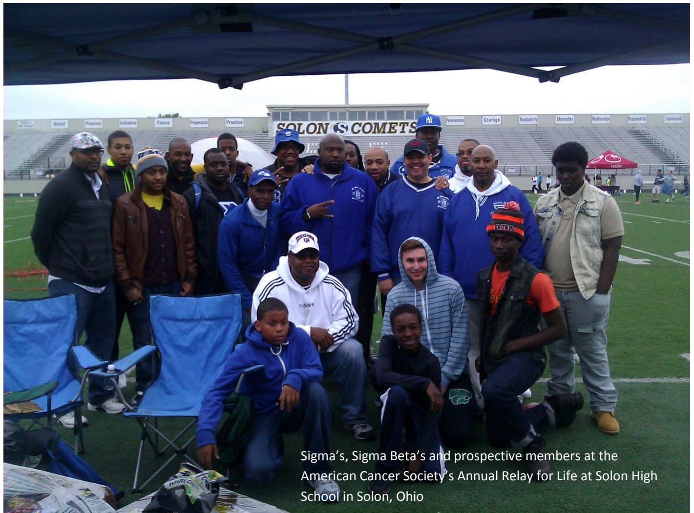
Sigma's, Sigma Beta's and prospective members at the American Cancer Society's Annual Relay for Life at Solon High School in Solon, Ohio